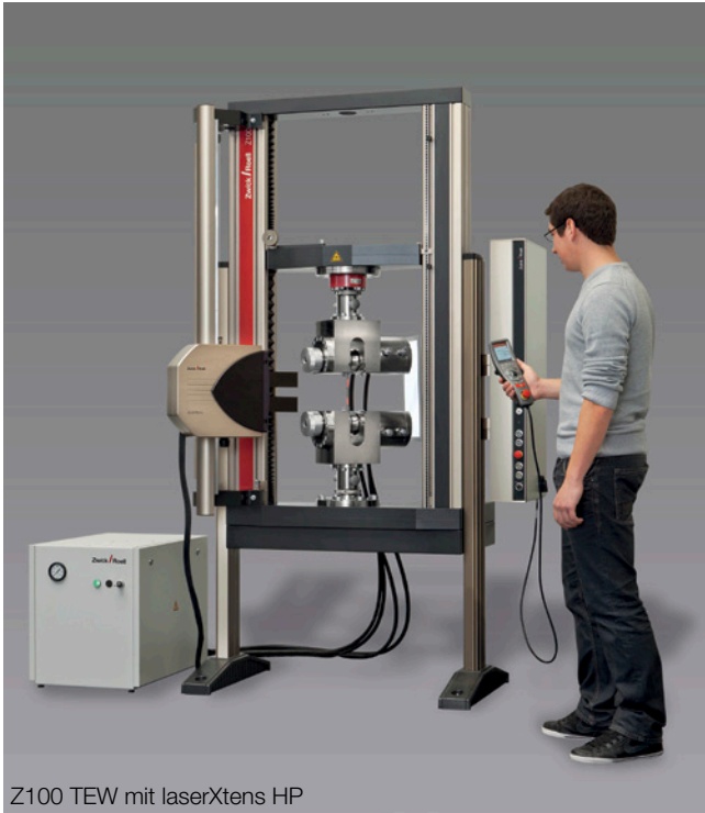
Z100 TEW mit laserXtens HP

Table-top machines Z030 up to Z100 of the AllroundLine