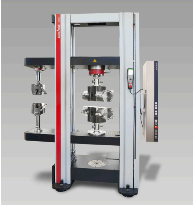
AllroundLine Z250 SNS (lateral test area)

Floor testing machines Z250 of the AllroundLine with lateral test area