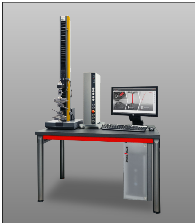
zwicki 1120 after modernization with testControl II