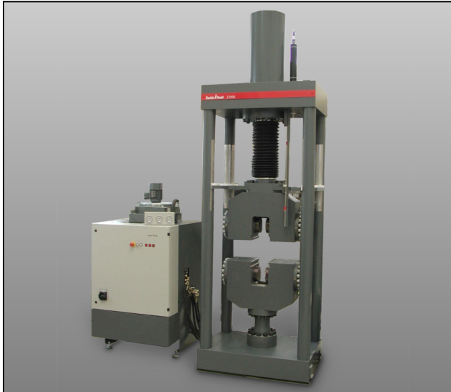
ZwickRoell Z1200H with hydraulic grips