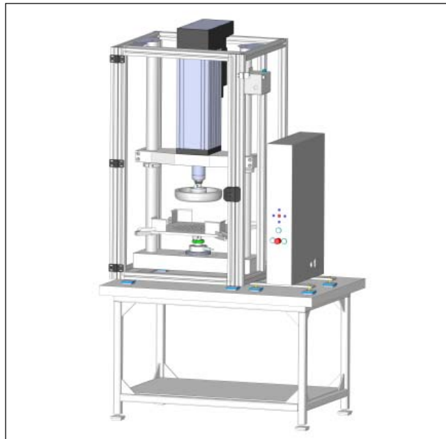
Drawing dynamic fatigue test bench