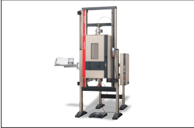
AllroundLine Z010 with 400 mm wide temperature chamber