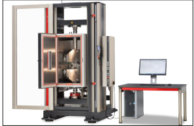
AllroundLine Z250 with 600 mm wide temperature chamber