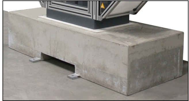
Pendulum impact tester with concrete base