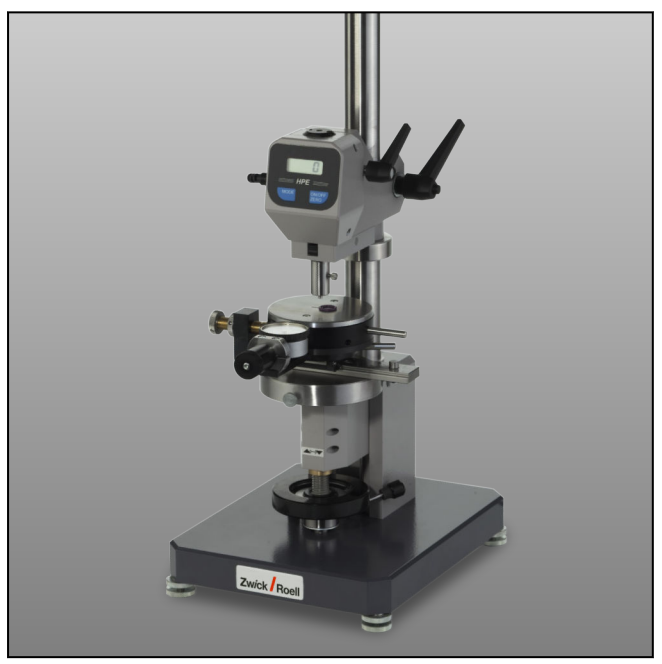
ZwickRoell 3103 IRHD micro compact Hardness Tester