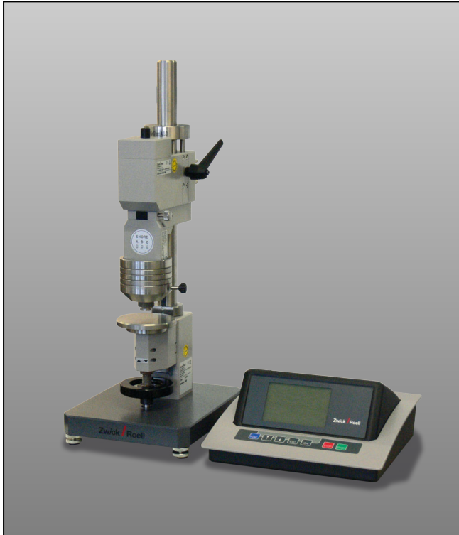
ZwickRoell 3105 combi test Hardness Tester