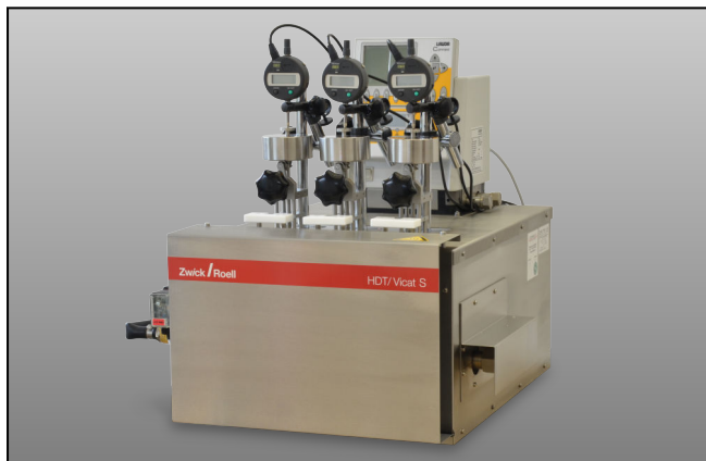
HDT/Vicat 3-300 standard with 3 measuring stations