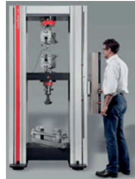
Universal testing system