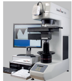
Vickers hardness testing machine