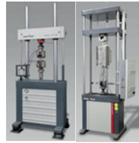
Typical fatigue and creep testing systems