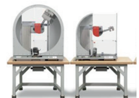
Pendulum impact testing machines