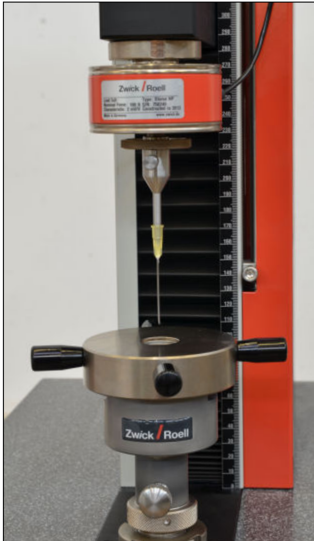
Mounting for attaching injection needles with Luer cones