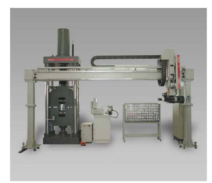
Pic 1: Robotic testing system 'roboTest P'

Robotic Testing System 'roboTest P' (Portal) for Metals