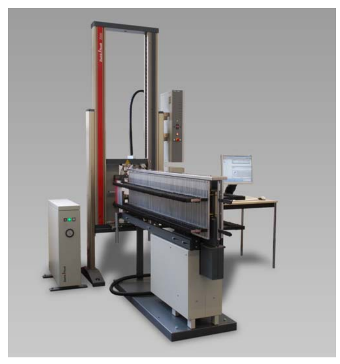
Robotic Testing System 'roboTest F'

Robotic Testing System 'roboTest F' (Clamp) for Flexible Specimens