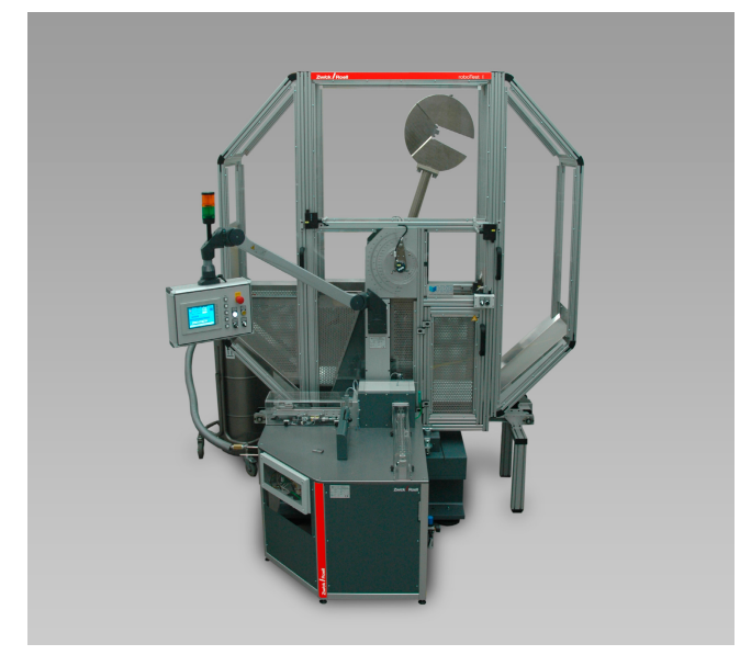
Robotic testing system 'roboTest I' for pendulum impact tester RKP 450 or PSW 750

Robotic Testing System 'roboTest I' (Impact) for pendulum impact testers