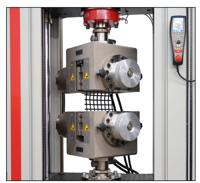
Type 8593 hydraulic grips, Fmax 250 kN

Hydraulic grips Type 8393, Fmax 50 kN, Type 8493, Fmax 100 kN, and Type 8593, Fmax 250 kN