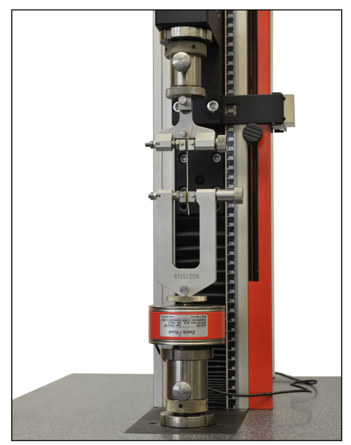
Spring loaded grips Type 8135, Fmax 20 N