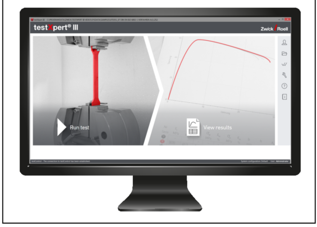
Tester view with relevant functions