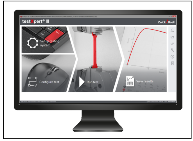
Administrator view with all functions

Should users be able to carry out functions only within a defined area of responsibility? Or would you like to