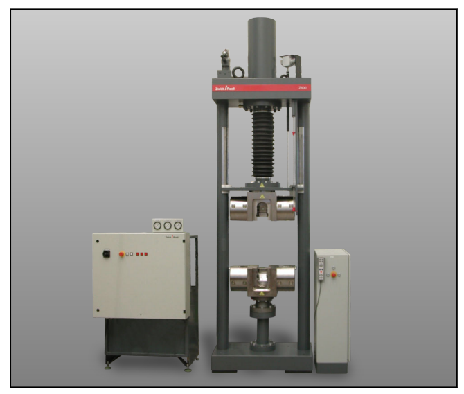
ZwickRoell Z600H with hydraulic grips