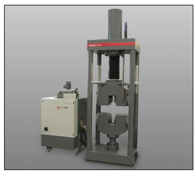
ZwickRoell Z1200H with hydraulic grips