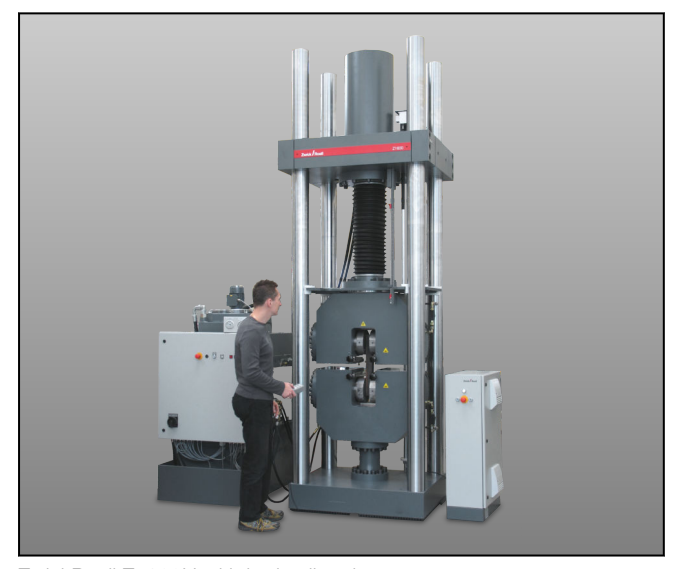
ZwickRoell Z1600H with hydraulic grips