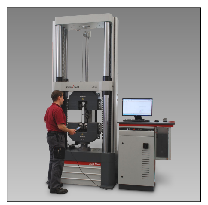
Z600E with hydraulic grips