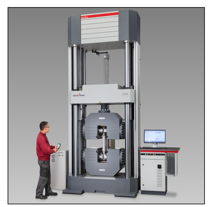
Z2500E with hydraulic grips