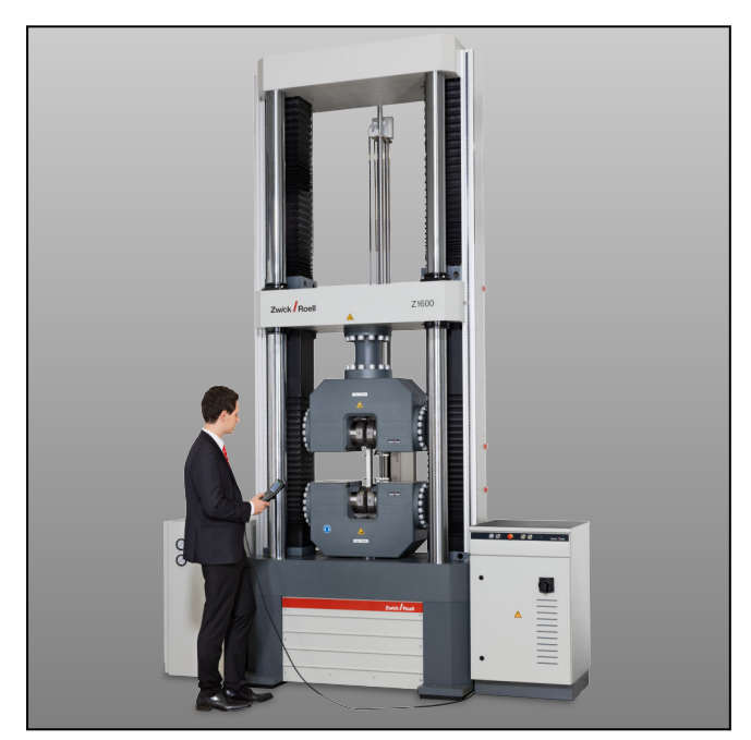
Z1600E with hydraulic grips