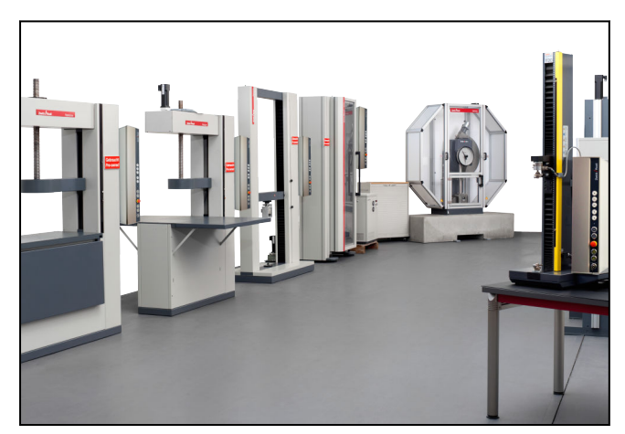
Our extensive selection of pre-owned testing machines and instruments