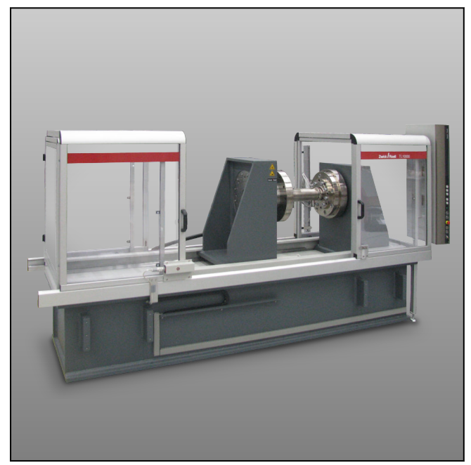
TorsionLine torsion testing machine with testControl II