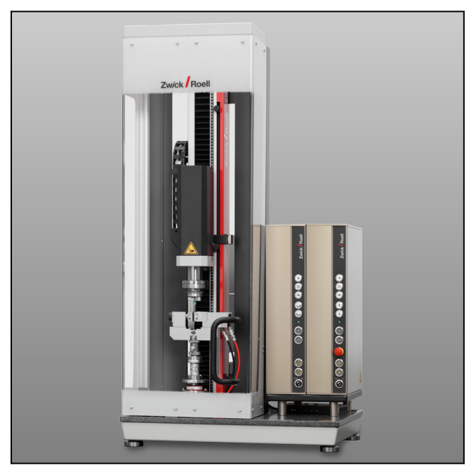
Test arrangement with pneumatic grips and 3-jaw chuck