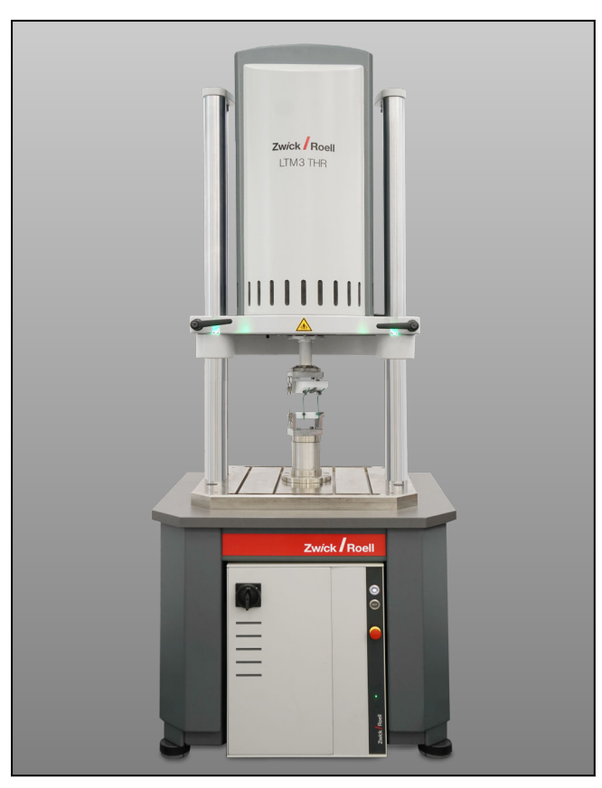
LTM 3 Torsion