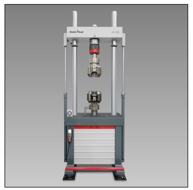
HA 250 with BOW specimen grips