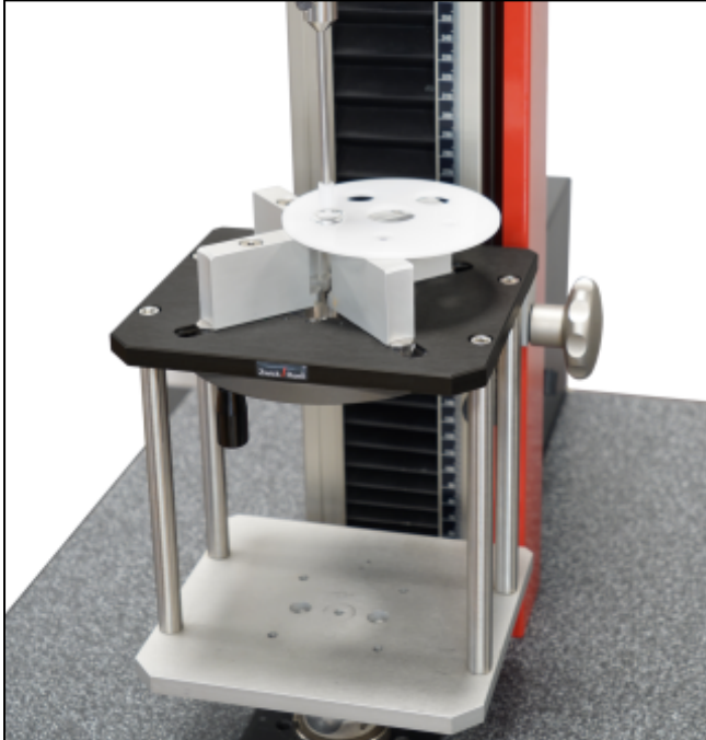
Test arrangement with universal mount, support fixture and compression die