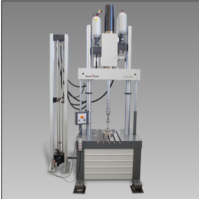
HTM 5020 with T-slotted platform