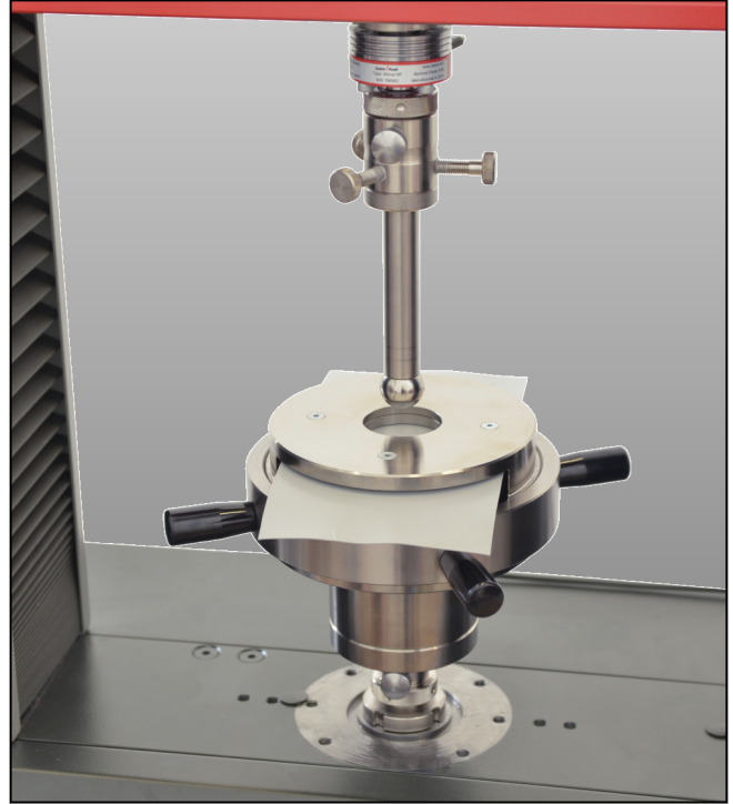
Ball burst test device