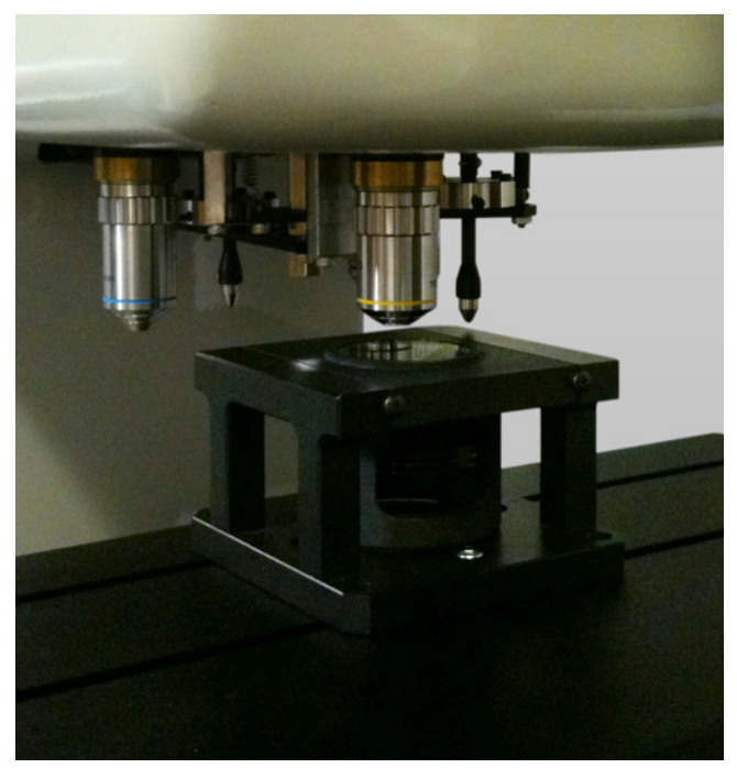
Fig. 1: Specimen mount in a ZHVµ hardness tester