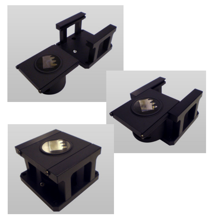
Fig. 2: Specimen mount: seperate, sliding in, closed up

Effectiveness is improved because a flat face, parallel to the X-Y stage is presented which allows for more reliable, square indentations (i.e. within standard) and reliable measurement without the need for frequent refocussing. Efficiency is improved because the specimen can be fixed in a known position on the table and when used with scanning functionality of HD software an image of the specimen can be quickly acquired.