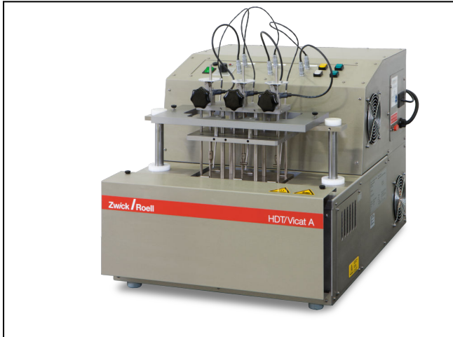
HDT/Vicat 3-300 A1 with 3 measuring stations