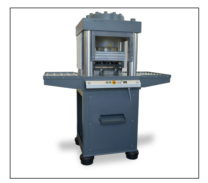
RZ 100 hydraulic blanking machine

The open design of the machine and the blanking tool (C-shape) allows removal of test pieces from sheets and foils also. If several blanking tools are in use, the side extension table (option) is recommended. This is in the form of a roller table and enables the blanking tools not currently required to be stored out of the way. Using the extension table, tool changes take about 20 seconds, offering significant time-savings in the event of frequent tool changes. The M-cut 65 specimen blanking machine (for 650kN compressive force) is suitable for material thicknesses from 0.04 to 6mm (depending on tensile strength and specimen shape).