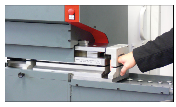
Fast blanking-tool change with side extension table for M-Cut 65

Specimen blanking machines for specimen preparation of metals