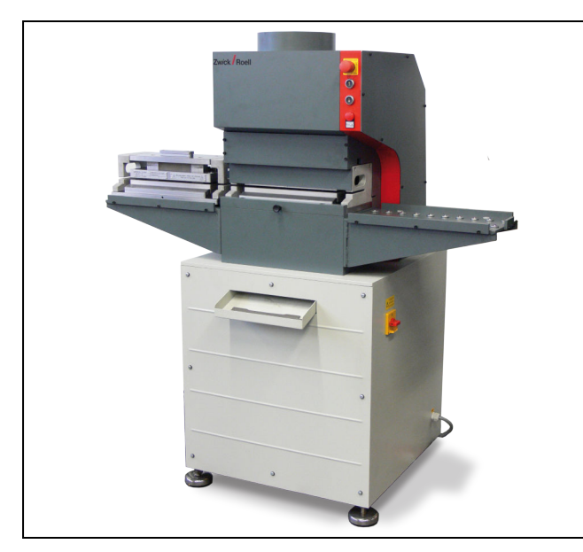
M-Cut 65 hydraulic specimen blanking machine with side extension table option

Specimen blanking machines for specimen preparation of metals