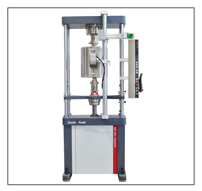
Kappa 100 SS