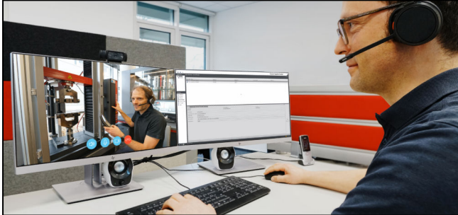
Secure remote access for service experts via remote support