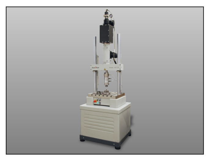
HCT with support base (option)